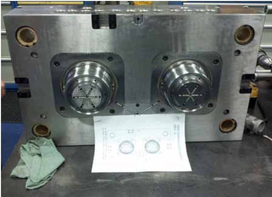
↑ Tooling is shown with the transducer planning diagram, assisting in monitoring all aspects of the injection molding process.

Using this data, Kaysun's scientific molding engineers determine exactly what is happening with the material inside the mold, specifically in terms of viscosity. They know (rather than guess) how the polymer flows into and behaves inside the tool. By recording data when the machine is producing at peak efficiency (top productivity with minimal scrap), engineers